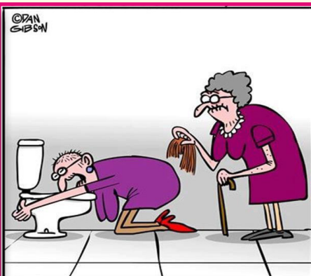
Your best friend is the one that will hold your hair out of the way after a night of hard partying.