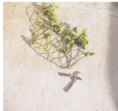
Plate 2. Unrooted vine cutting

The 2 x 2 factorial experiment was laid out in a completely randomised design, using the two sweet potato varieties in two different treatments, replicated three times. The plants were established on ridges 1.5 m apart, with 0.6 m spacing between plants within the rows. Each plot consisted of 10 plants.