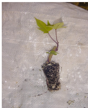
Plate 1. Rooted planting material

The study was carried out at the Gladstone Road Agricultural Centre, New Providence, from April to October 2010. Two different types of planting material were examined in this experiment: rooted cuttings (Plate 1) and freshly cut unrooted vines (Plate 2). Two node cuttings of sweet potato were rooted in polystyrene trays containing a potting mixture (Pro-Mix ® ). The plantlets were propagated under shade and were kept well watered until they produced a well-developed root system and at least two fully expanded leaves. After two weeks of growth, the plants were transplanted directly to field plots. At the same time, fresh vine cuttings of approximately two feet in length were cut from stock plant material in the field and planted directly to the experimental plots. The two white fleshed sweet potato varieties used in this evaluation were ‘Antigua’ and ‘Six Weeks’.