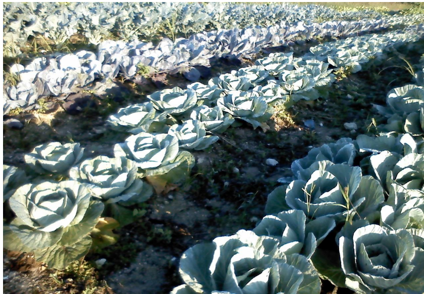
Cabbage variety trial at the Gladstone Road Agricultural Centre, 2013

Three cabbage varieties, 'Benelli', 'Caribbean Queen' and 'Cairo', were evaluated in a completely randomised design with three replications at the Gladstone Road Agricultural Centre during 2013. Cabbage heads were harvested between 89 and 116 days after transplanting to the field and evaluated for head weight, head width and head length. The results obtained showed that the variety 'Caribbean Queen' produced the largest head weight and head width. The variety 'Caribbean Queen' also exhibited the highest potential yield of marketable head weights (45.4 t/ha) compared to 'Benelli' (37.0 t/ha) and 'Cairo' (33.6 t/ha). The three varieties were determined to be capable of producing acceptable yields under open field conditions in The Bahamas.