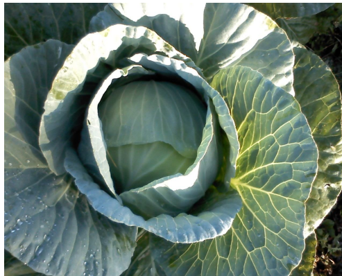
Developing cabbage head grown at the Gladstone Road Agricultural Centre during 2013

The cabbage is a cool season crop which grows best under cool, moist weather conditions (Thompson, 2002). This leafy vegetable can grow well on a wide range of soil types provided adequate moisture and fertiliser is supplied. It can be grown in The Bahamas year round, but peak production occurs during the cool season of November to March. During the summer months the cabbage is more susceptible to disease problems and attacks from insect pests. The length of the growing period is shorter during the cooler season, between 90 and 100 days, while summer cabbages can take up to 140 days to mature. For a successful cabbage production, however, it is important to select varieties appropriate for local growing conditions.