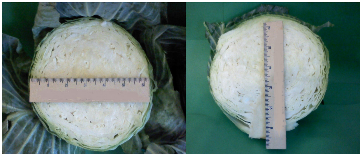
Plate 1. Mature compact heads of cabbage cut to show how measurements were calculated; width (left) in horizontal section and length in vertical section (right).

Harvesting extended from 29 th January to 6 th March, 2013 as the cabbage heads reached their optimum maturity. The variety ‘Cairo’ was harvested at a later maturity date than the other two varieties in this study. For each variety, six cabbage heads were harvested randomly from each of the three replicated plots. Only heads of marketable size were harvested. Outer leaves were stripped from the heads and the weights recorded. Head width (diameter) was measured with a ruler across the horizontal section of the cabbage head. Head length was measured longitudinally from the top of cabbage to the bottom. Plate 1 illustrates the method used to determine the head width and head length of the three cabbage varieties.